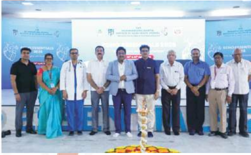
Membership drive in KG