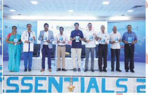
Membership drive in PSG