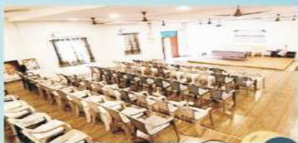
Dr. Punnai Vanam Hall 100+ seating capacity