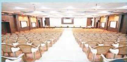
IMA Main Hall 350+ Seating capacity